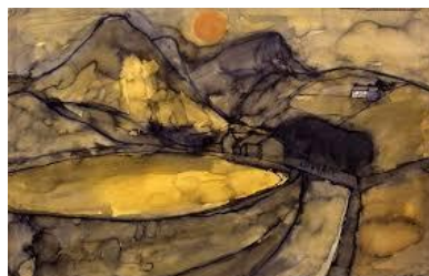
The White Cottage (Percy Kelly)